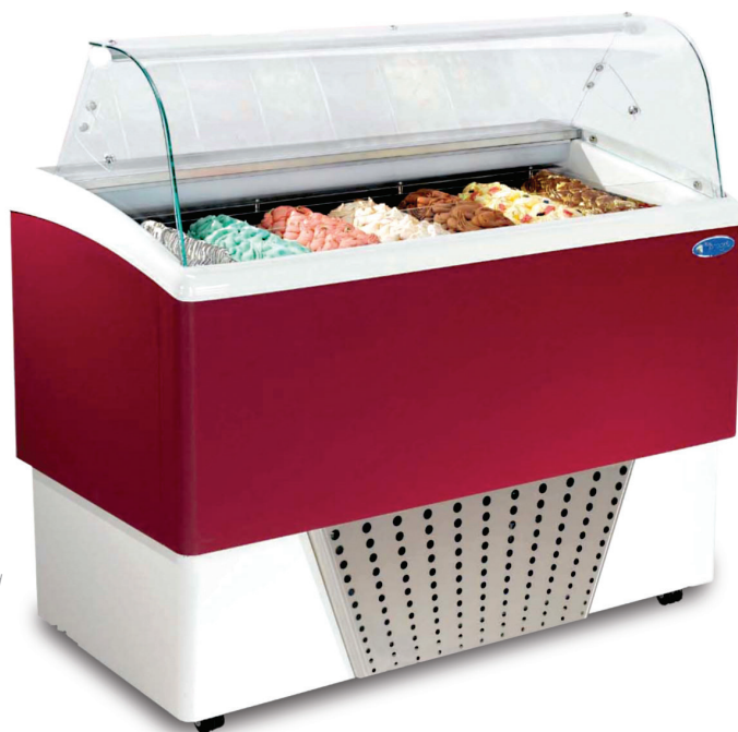
BRIO 7 Pans not included